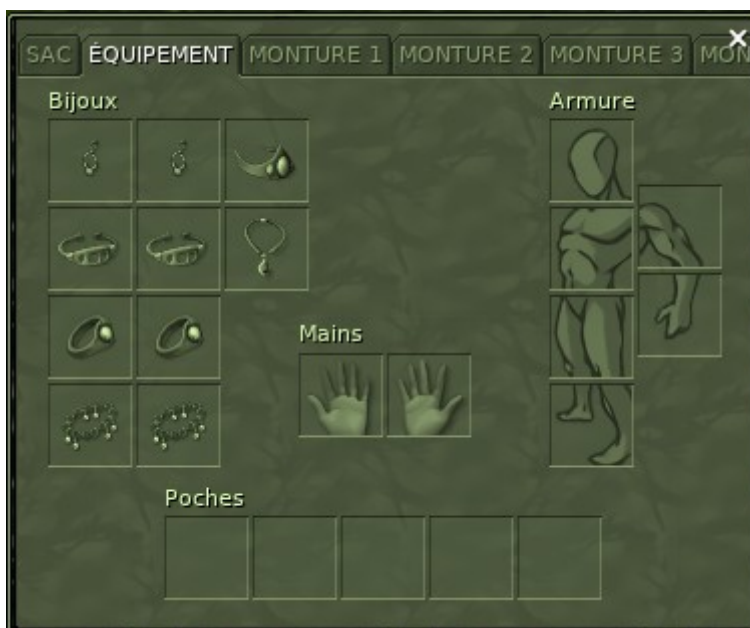
Sneak peek of the first iteration of the new equipment window, including the addition of five pockets.

A : At the moment, I'm working on an inventory sorting system and adding "pockets" to the equipment window for quick access to consumable items. There are also a lot of small additions and Q.O.L. fixes, some of which have been in demand since the start of Ryzom. It's possible that these additions will already be in-game at the time of publication.